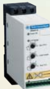
Altistart 01N2 from 6 to 32 A