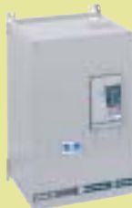
Altivar 38 0.75 to 315 kW