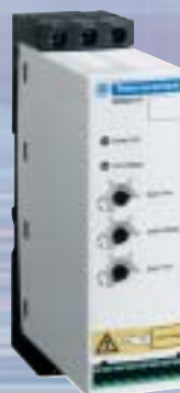
Altistart 01 model U from 6 to 32 A

For suppressing torque surges on starting, soft stopping... and for control at any instant of your application.