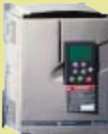
Altivar 58 0.37 to 75 kW