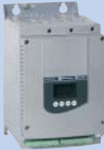
Altistart 48 17 to 1200 A